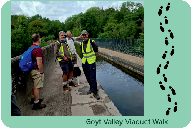
Goyt Valley Viaduct Walk

During the #NationalWalkingMonth of May we joined fellow walkers and our @GMRingway Stage Guardians for the #FestivalofWalking.