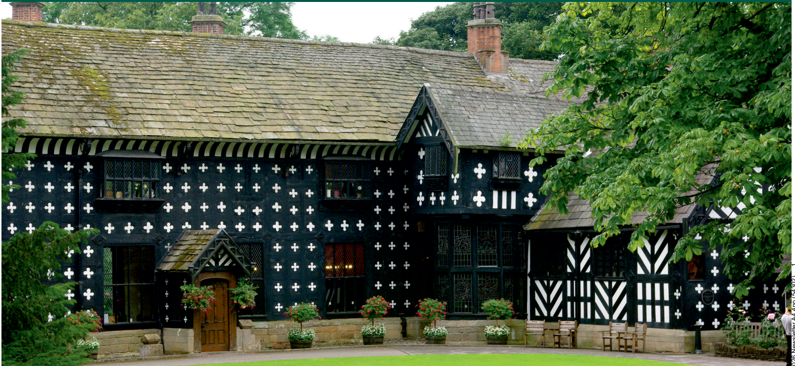
Salmesbury Hall, Preston