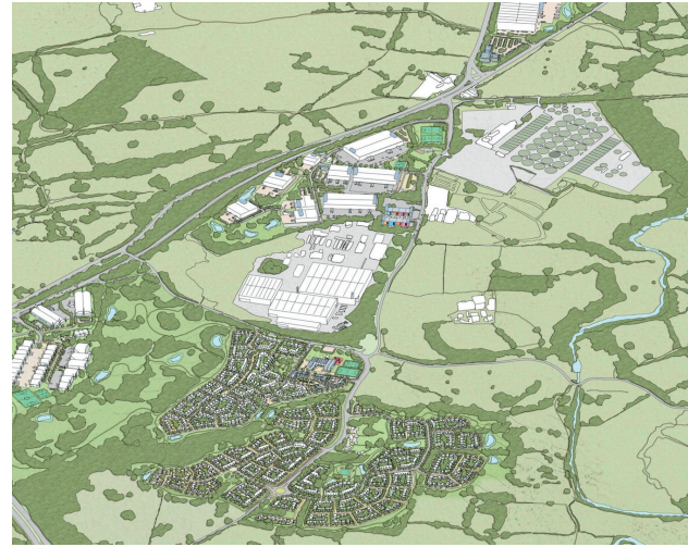
Proposed ‘Cuerden Garden Village’ plan

If you’re interested in finding out more about these roles please visit the jobs section on our website.