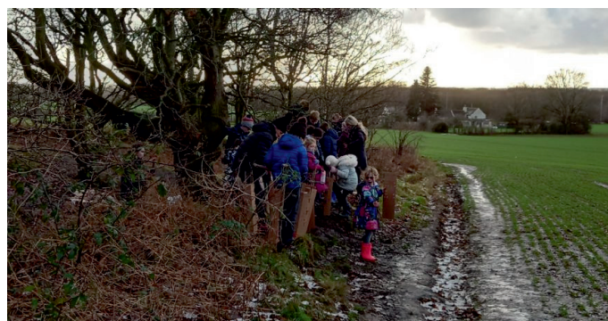
Young Wilders at work

Our members have been active in supporting our Hedgerow Heroes campaign locally. Thanks to their vigilance and action in the past few months we have been contacted by members in two areas about old hedges being pulled out or damaged by agricultural operations and have contacted the relevant planning authorities on their behalf. Both authorities have been responsive and followed up on these complaints.